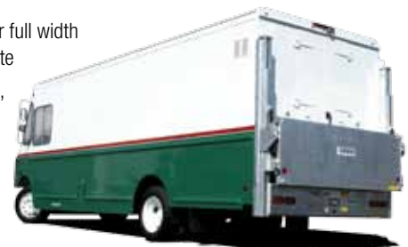
Morgan Olson offers multiple paint schemes, installs graphics packages and offers liftgates.