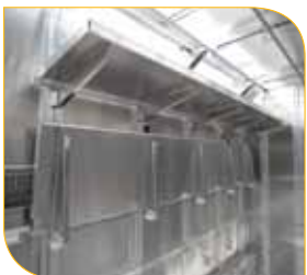
Cargo shelving available in a fixed or folding position.