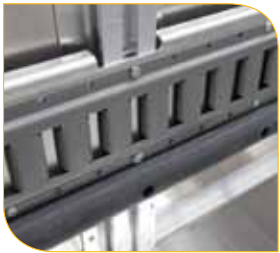
Our cargo packages attach and adjust to the vertical sidewall stiffeners, using spring-loaded nuts, for infinite flexibility.