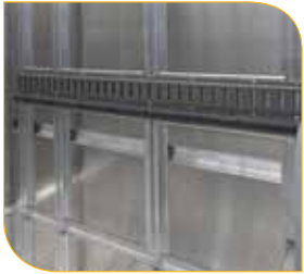
The E-track moves up and down for easy customization.