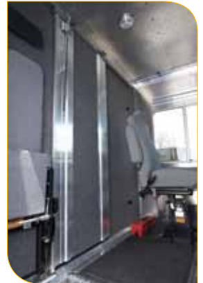
Standard driver seat with optional cloth covering and armrests, aluminum bulkhead with center sliding door, covered with optional sound reduction material, and optional bulkhead mounted jump seat.