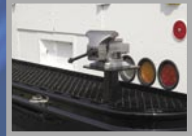
Right hand bumper vise mount