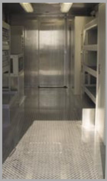
1/8" aluminum diamond plate on cargo center aisle