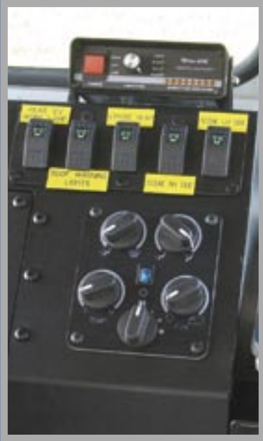
All lighting functions labeled with placards