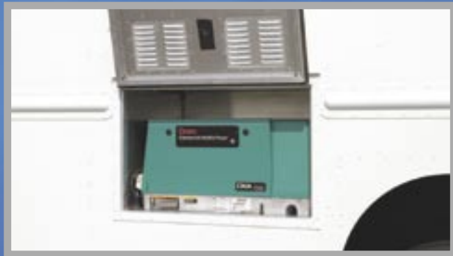
Onan or Honda diesel and gas generators. Available as portable or stand alone - connected to chassis fuel system.