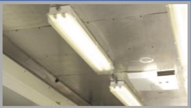
120V 48" fluorescent lights with dust and moisture resistant cover