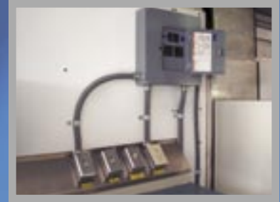
50 amp service panel with wiring in liquid tight wire conduit