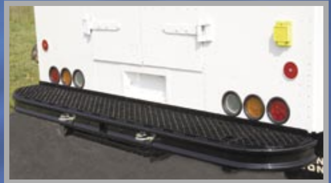
12" deep steel bumper with Bustin grating and receiver hitch rated at 5,000 & 10,000 pounds