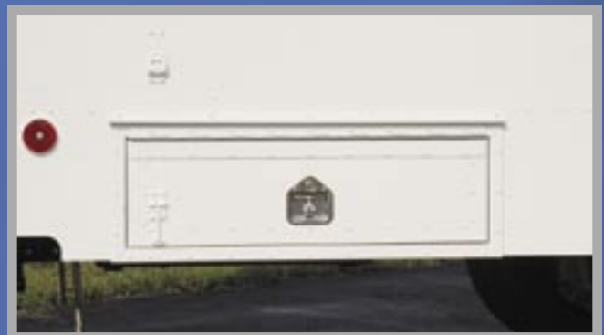
Below floor exterior compartments mounted in lower skirt