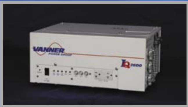
Inverter packages designed with Fleet Gold