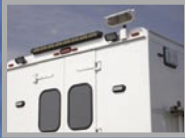
Warning and work lights