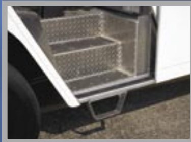
Stirrup step on cab step well