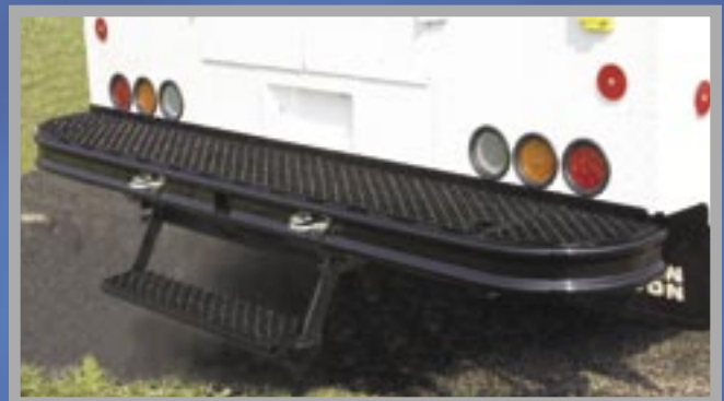
Fold up step on rear bumper