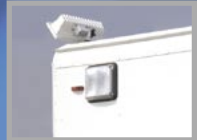
12 volt work lights sidewall mounted