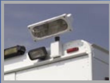
Rear roof line permanently mounted with vertical adjustment