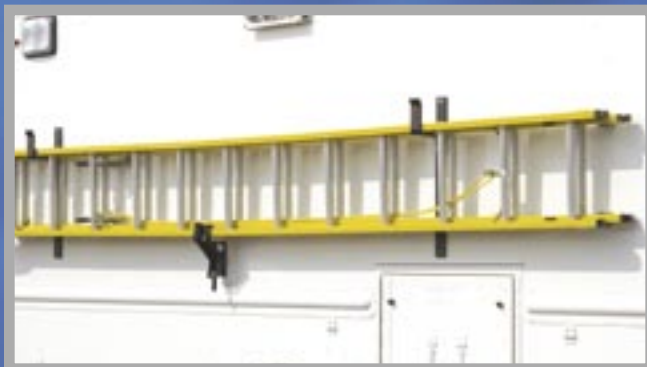
Exterior ladder brackets with vertically adjustable Eberhard spring clamp