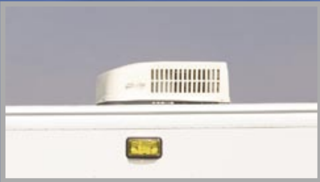
120V - 15,000 BTU Coleman and DuoTherm roof mounted air conditioners