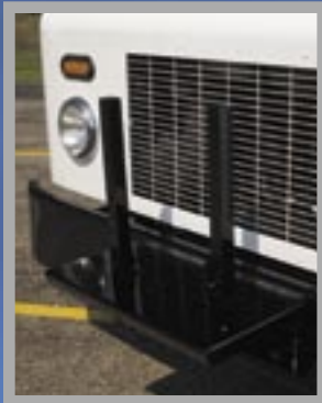
Safety cone holder on front bumper. Solid mount or fold down models available