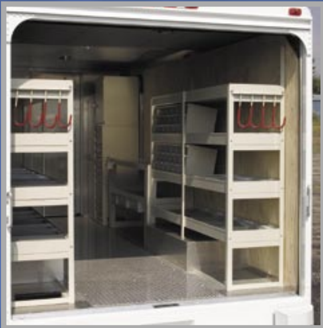
Cargo shelving packages- aluminum or steel. Cargo shelving is fastened to 11 gauge vertical steel Z-posts vs. aluminum hat sections to provide secure installation.