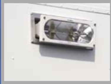
Recessed side or rear wall mounted at 10 degrees