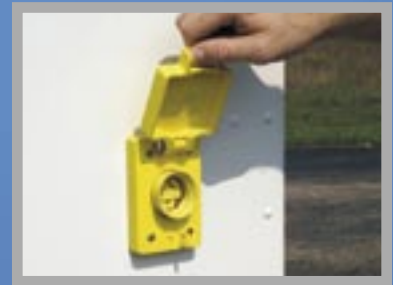
Interior and exterior 120V outlets