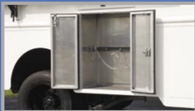
Exterior compartments for items such as propane tanks and jack hammers